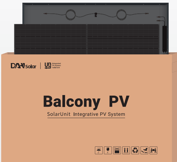
Product Packaging Diagram